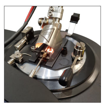
Auto dip and flash detection