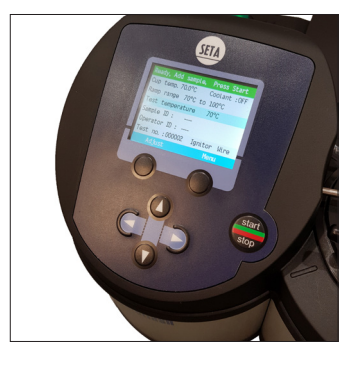
Wait for cup to reach temperature